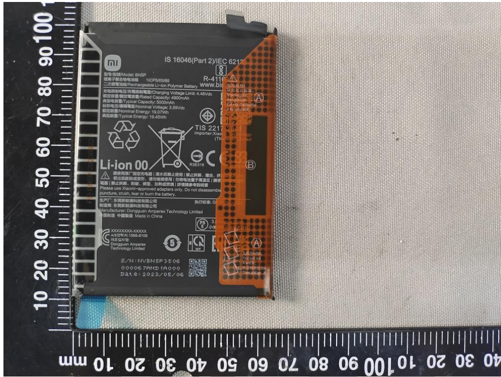
Back view / 后视图